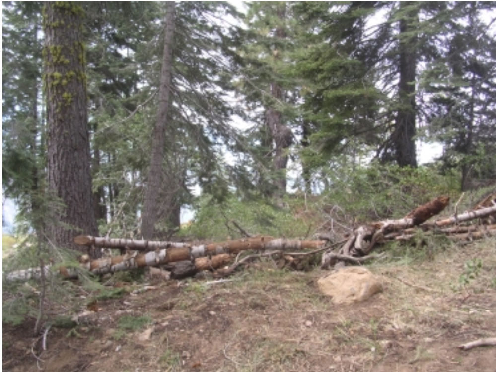
Slash across the OHV trail